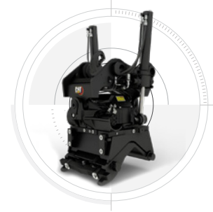
PIN GRABBER COUPLER